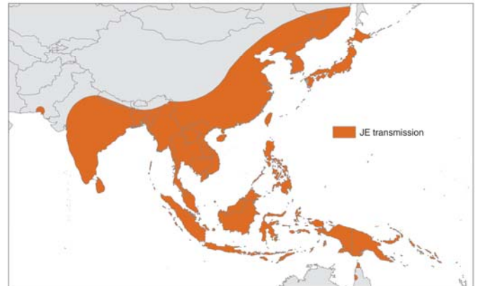
Regions reported to have transmission of JE virus

Source: Adapted from Vaccines , 4th ed. Philadelphia, PA: WB Saunders, Inc.; 2004:919-958.