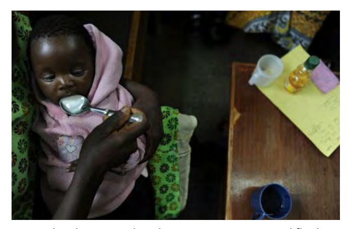
Patiently administered sip-by-sip, ORS restores vital fluids when young children suffer from dehydration caused by severe diarrhea.

Packaged as a powder to be added to safe and clean water, ORS can be administered by caregivers in the home, making it particularly useful in resource-poor settings where access to clinical care is limited. If all parents could access and use ORS, diarrhea deaths would drop by 93 percent.<sup>ii</sup> But a lack of provider and community knowledge in many developing countries, in addition to persistent access