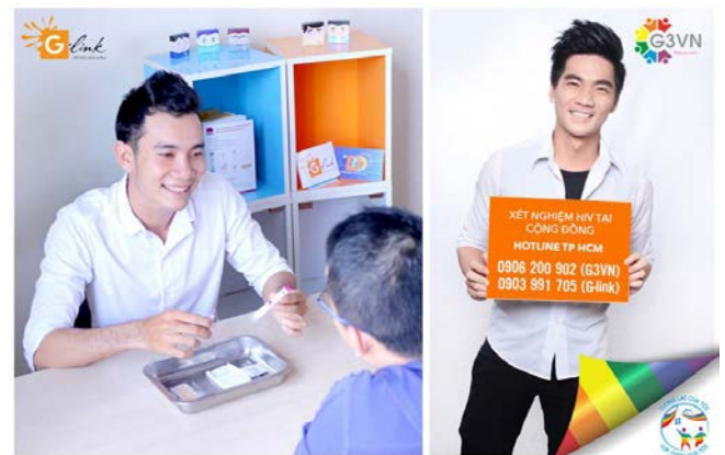
Promoting Ho Chi Minh City-based lay testing services to the 137,000+ followers of the Xóm Cầu Vồng Facebook page.

The services have also been heavily promoted on the Xóm Cầu Vồng (Rainbow Village) Facebook page, a much needed open space for MSM and TGW in Vietnam to connect and exchange information on HIV prevention, testing, and care, launched by Healthy Markets and community partners in 2015.