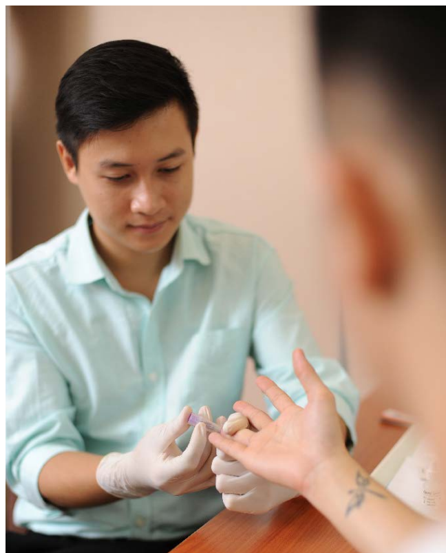
Lay providers deliver HIV testing services using a rapid HIV diagnostic tests, including a whole-blood (fingerstick) test (pictured), which can be administered easily and quickly.

The pilot was launched by the PATH-led Healthy Markets initiative, funded by the U.S. President's Emergency Plan for AIDS Relief (PEPFAR) through the U.S. Agency for International Development (USAID). The pilot is implemented in partnership with the World Health Organization (WHO), and the Vietnam Ministry of Health.