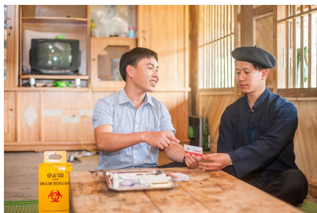
A village health worker counseling a client in his home before delivering HIV lay testing using the Alere Determine™ HIV-1/2 rapid diagnostic test.

The selected lay providers attend intensive two-day trainings facilitated by Healthy Markets and the local partners. The trainings equip lay providers with sufficient skills and knowledge to deliver quality HIV lay testing using the Alere Determine™ HIV-1/2 Ab rapid diagnostic whole-blood test or the OraSure OraQuick ADVANCE® rapid HIV-1/2 antibody test (involving an oral swab), practicing the full procedure with both anatomic models and real people. Following the training, the lay providers are supplied with job aids and test kits for the immediate initiation of services. Healthy Markets and local partners regularly monitor and supervise the lay providers as they test clients in the community.