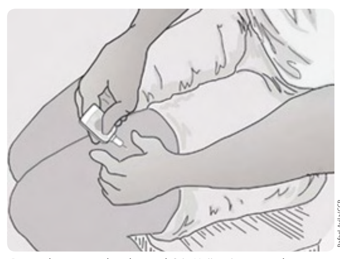
Research suggests that depo-subQ in Uniject increases the possibility for a woman to easily inject herself at home.

As depo-subQ in Uniject is not yet available for use, there is no published peer-reviewed research on the feasibility and acceptability of self-injection using this