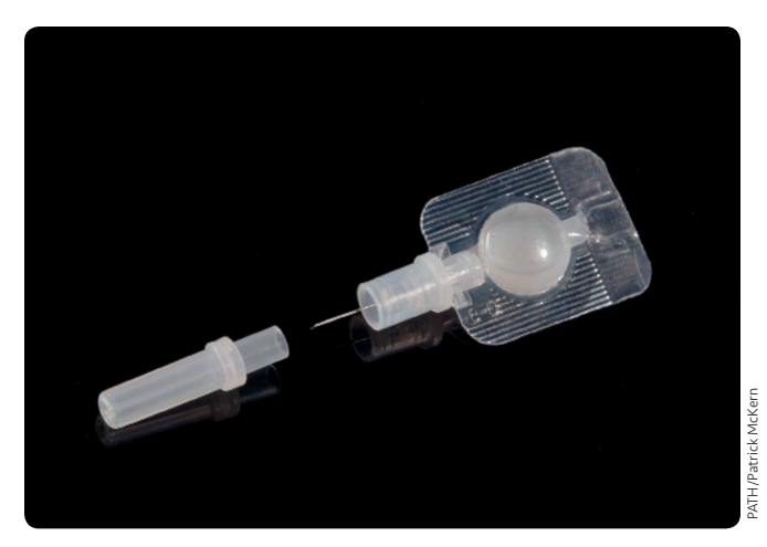
The Uniject injection system.

Uniject is designed with a plastic blister filled with a single dose of medication for injection.<sup>22</sup> This design simplifies both storage and training. The provider administering the injection resuspends the depo-subQ by shaking the Uniject for 30 seconds, depresses the cap to activate the device, inserts the needle into the skin, and squeezes the blister to administer the full dose. A one-way valve prevents the device from being refilled, thereby reducing the risk of reuse or infection transmission. Table 4 highlights key benefits of the Uniject injection system.