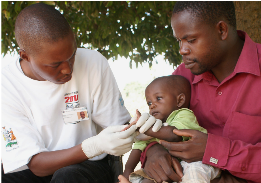
A young boy gets tested for malaria during a national malaria indicator survey activity.

MACEPA is partnering with the global community to eliminate malaria in Africa.